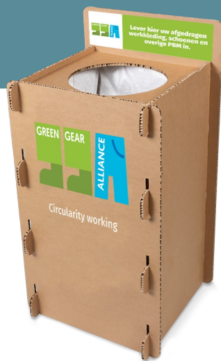
5 MiniBags + DisplayBox