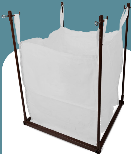
BigBag + Holder