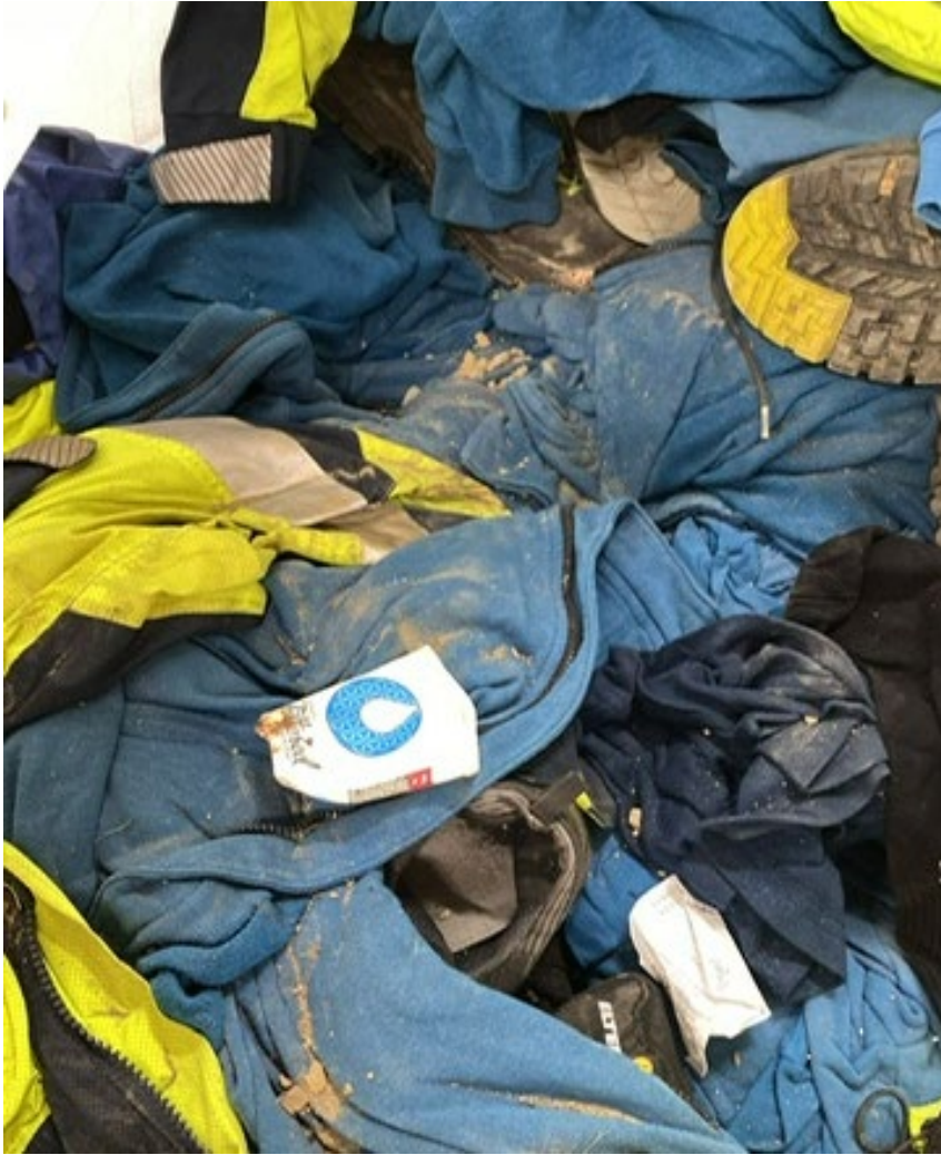
✘ Very dirty items